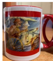
Borho Print Mug