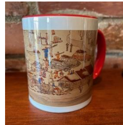
Loewel Print Mug