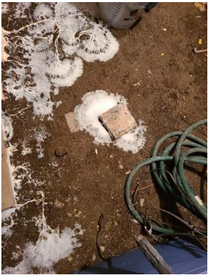
Mold in Owens House basement

and unique collections. Before we can realize the full potential of this extraordinary facility, a major moisture remediation and mold abatement project must first be completed. This expensive work is well beyond our annual operating budget. So, the museum trustees have embarked on a major capital fund raising initiative, seeking both state and federal support as well as foundation funding and individual donors to accomplish this essential work. Going forward, we will be updating our members on these fund-raising efforts to restore this wonderful and vitally important museum space. We hope you will generously support this effort.